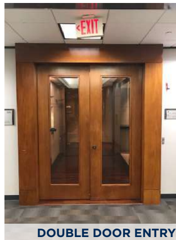
DOUBLE DOOR ENTRY